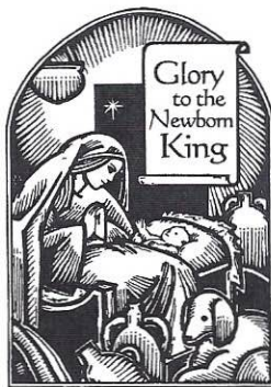
Jesus is born