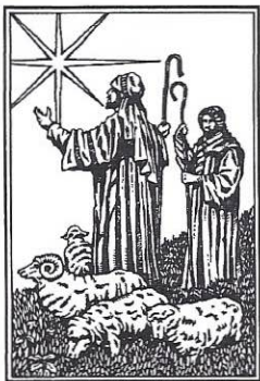
Shepherds & sheep