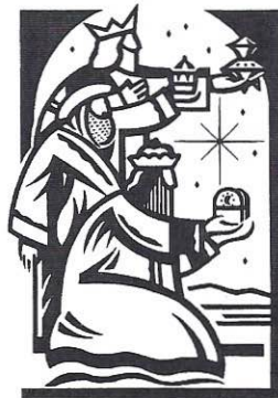
Wise Men give gifts