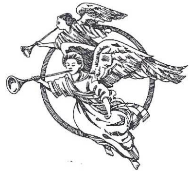
Angels announce that Jesus and John will be born soon.